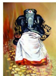
Ganpati-27, Acrylic on Canvas(30"x24")